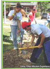
Big Day of Serving with transforming America's neighborhoods