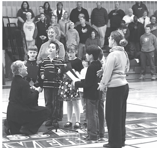
Our Children's Choir sang the National Anthem at a recent UMass-Lowell basketball game! Great job!

Next Sunday: Is 58:7-10/1 Cor 2:1-5/Mt 5:13-16 LPI